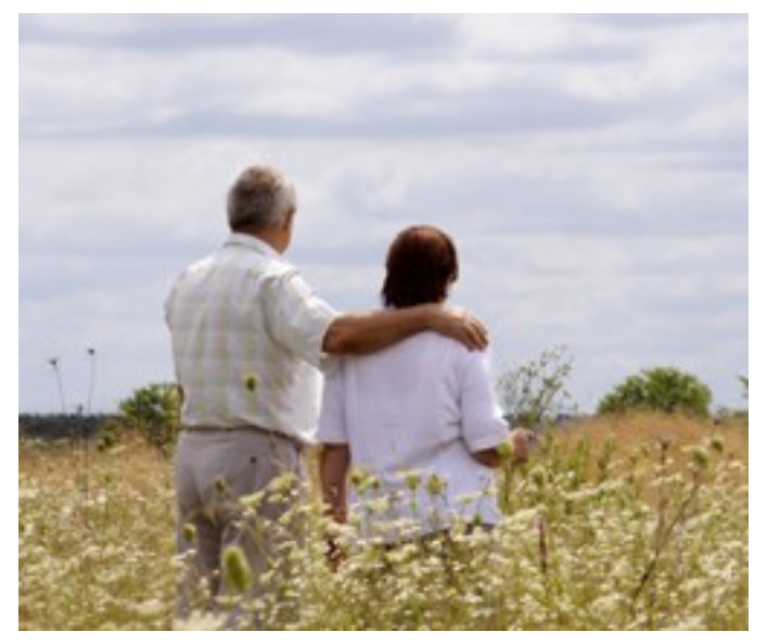
Post Radical Prostatectomy Urinary Incontinence

The International Continence Society has defined urinary incontinence as the involuntary loss of urine that is a social or a hygienic problem and which is objectively demonstrable<sup>3</sup>. However, the majority of studies define urinary incontinence after radical prostatectomy as the use of more than one pad a day.