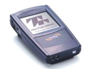
MyoTrac Infiniti<sup>™</sup> Encoder

Of course, prior to training, signal variability measures were clearly noted to vary directly in proportion to amplitude, i.e. higher signal amplitudes, the more variable, both at rest and during contrac-